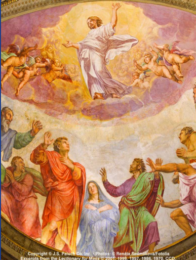
Copyright © J.S. Paluch Co., Inc. Excerpts from the Lectionary for Mass © 2001-1998, 1997, 1986, 1970, CCB.