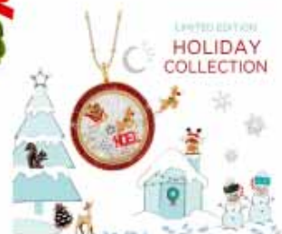
LIMITED EDITION HOLIDAY COLLECTION