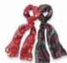
GIRL SCOUT HOLIDAY SCARVES