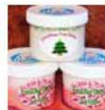
Hand Made Crafts